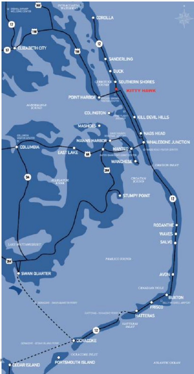
EXHIBIT I-A KITTY HAWK, NORTH CAROLINA REGIONAL SETTING