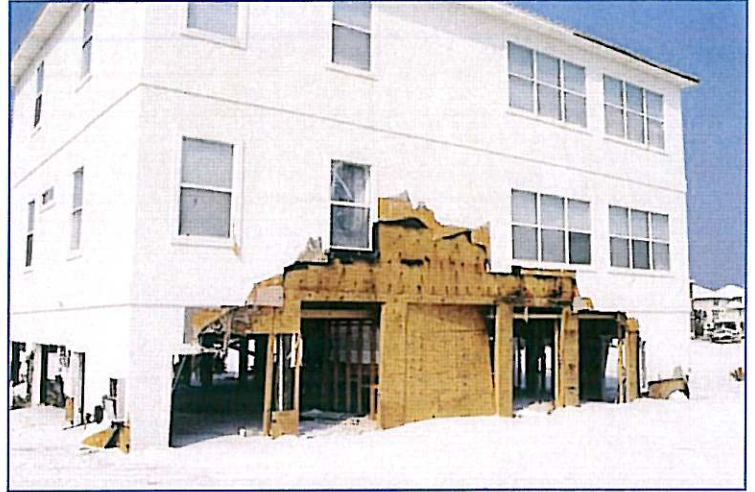
Siding on the non-breakaway portions of this elevated building was extended over breakaway enclosure walls and was damaged when breakaway walls failed under flood forces.