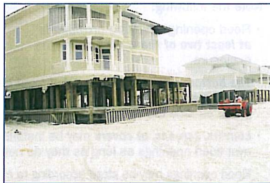
Breakaway walls that failed under the flood forces of Hurricane Ivan.

This Home Builder's Guide to Coastal Construction recommends the use of insect screening or open wood lattice instead of solid enclosures beneath elevated residential buildings.