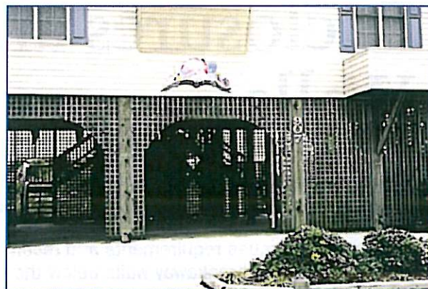
Open wood lattice installed beneath an elevated house in a V zone.