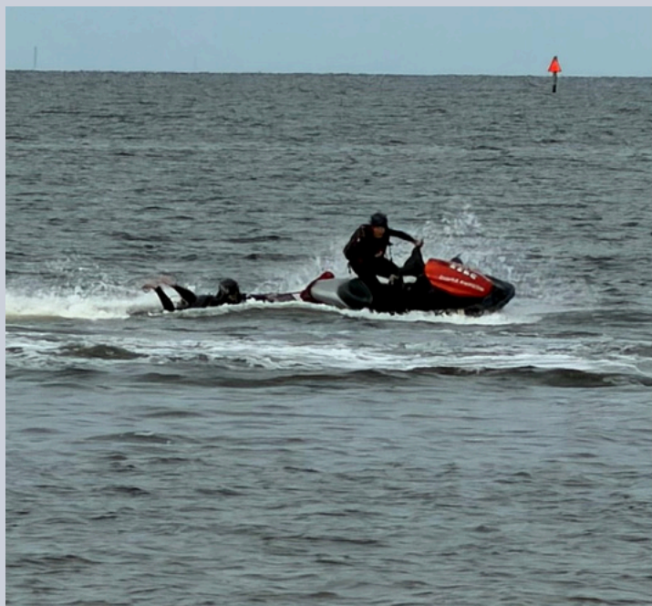
Water rescue training at Windgrass Circle Park

As we count down the days until summer, rest assured that our firefighters and ocean rescue guards are gearing up to keep everyone safe on the water and on land in Kitty Hawk. See you on the beach!