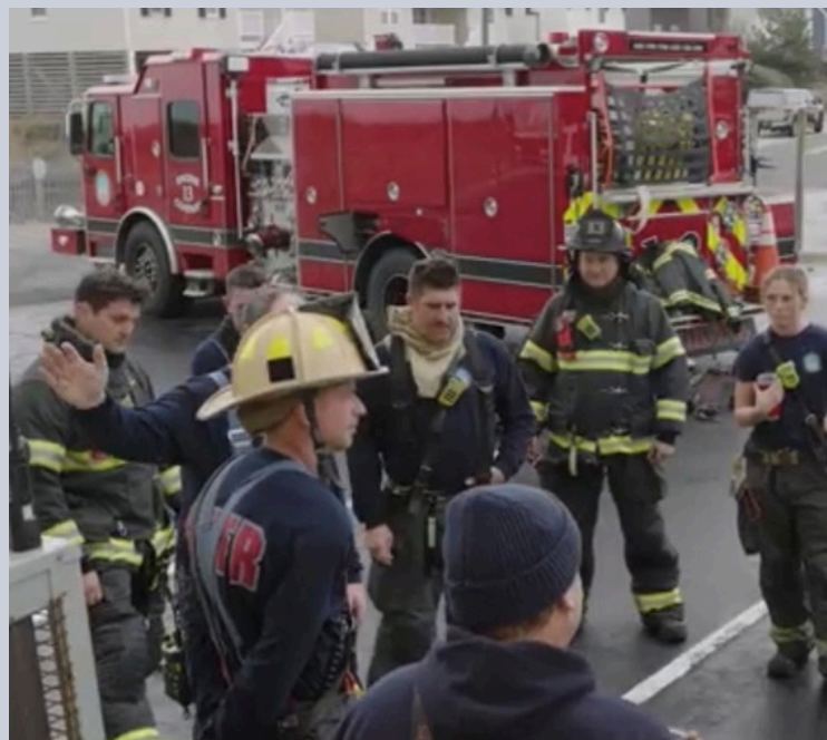
Multi-company training at Hilton Garden Inn