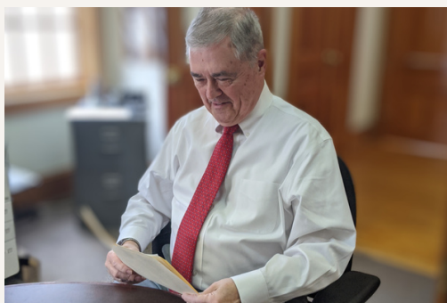
Mayor Craig Garriss conducting business at Town Hall.