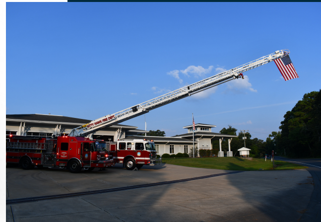
The Kitty Hawk Fire Rescue team was on hand supporting the riders.

THANK YOU TO ALL FOR DRIVING SAFELY WHILE THIS GROUP RODE THROUGH OUR LOVELY VILLAGE!