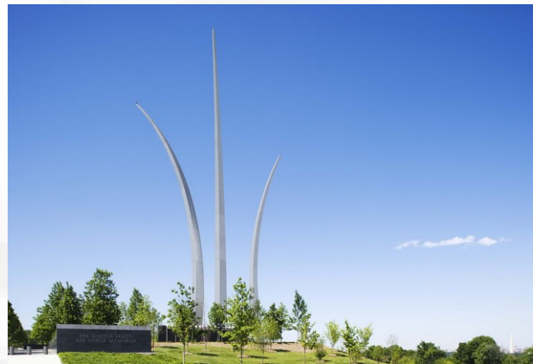
Last stop, Air Force Memorial, Washington, DC