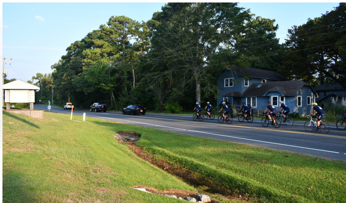
Kitty Hawk Police escorted riders down Kitty Hawk Road.

This ride begins here on the Outer Banks and travels through Richmond, Fredericksburg and ends at the Air Force Memorial in Washington, DC.